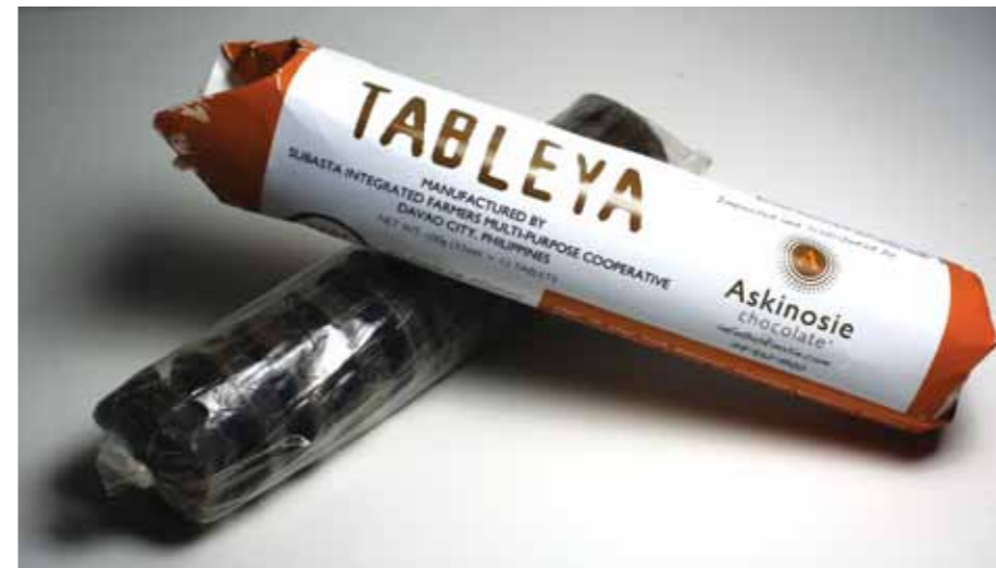
In the Philippines, a popular way to prepare tableya is to mix ground peanuts with cocoa beans while being cooked. It gives a richer, more intense flavor.

Says Askinosie, "I purchased 800 units of tableya for US$1 each. We sell each unit for $10 and the $9 profit goes directly to fund meals." Each tableya sold (at www.askinosie.com ) translates into 232 meals.