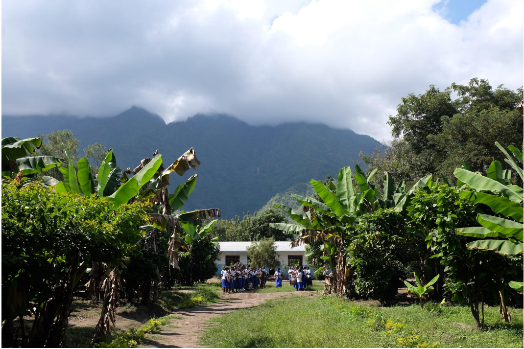
Cocoa Farming Village, Tanzania